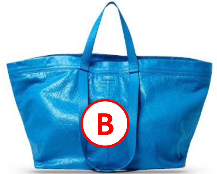
BALENCIAGA RM2,000.00 +