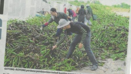
GOTONG-ROYONG perdana pembalakan keladi bunting turut membolehkan pembersihan mamail oleh penduduk.