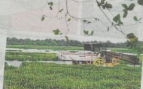
PEMBALAKAN keladi bunting secara mekanikal menggunakan mesin penul rumpai.